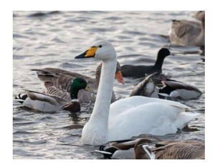
Shelduck Grey Heron Whooper Swan